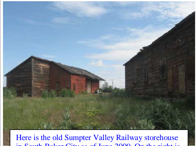
Here is the old Sumpter Valley Railway storehouse in South Baker City as of June 2009. On the right is the west wall of the enginehouse.

All in all, these two original SVRy buildings are in fairly good condition considering the lack of maintenance over the last three decades. There is little doubt that once we secure the rights to these structures, they will serve us well as a restoration shop and future museum of the Western Railway Preservation Society. Stay tuned as this conservation project develops!