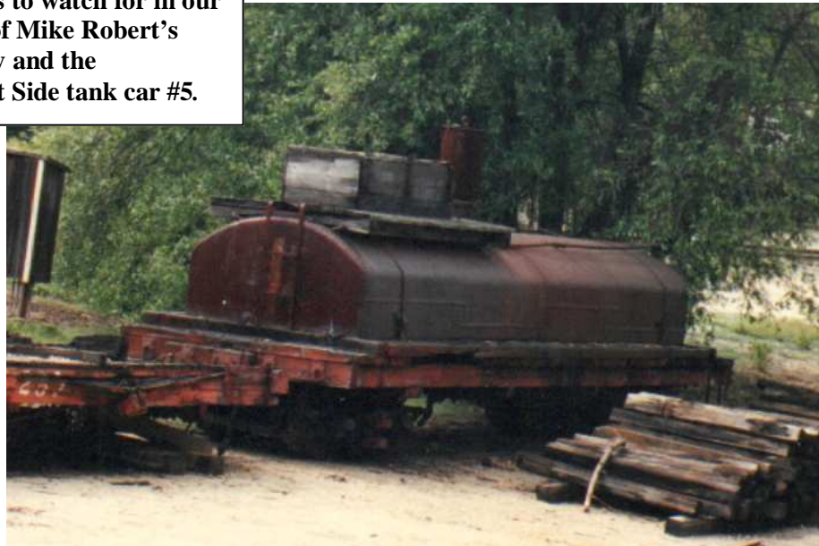
West Side tank car #5 at Roaring Camp in 1990.

Just one of the things to watch for in our next issue, is part 2 of Mike Robert's article on the History and the Resurrection of West Side tank car #5.