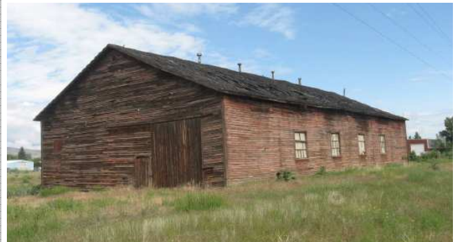
These two photos are separated by 62 years. Both show the south side of the Enginehouse that was the home to the SVRy's two mallets; the largest narrow gauge locomotives in America.